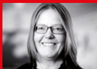
Christiane Raab Film Commissioner