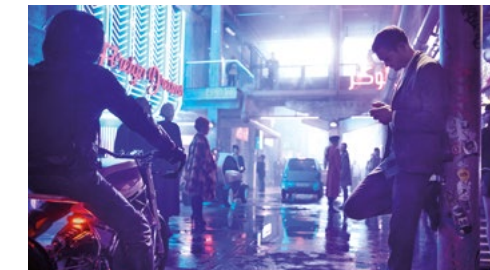
MUTE Director Duncan Jones With Alexander Skarsgård, Paul Rudd, Justin Theroux