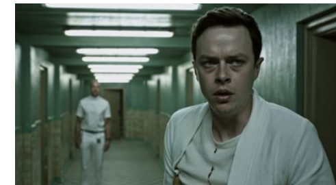
A CURE FOR WELLNESS Director Gore Verbinski With Dane DeHaan, Mia Goth, Jason Isaacs