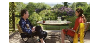
LES BEAUX JOURS D'ARANJUEZ Director Wim Wenders With Reda Kateb, Sophie Semin, Jens Harzer