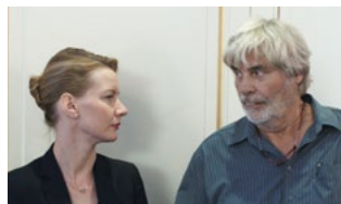
TONI ERDMANN Director Maren Ade With Sandra Hüller, Peter Simonischek, Trystan Pütter