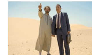
A HOLOGRAM FOR THE KING Director Tom Tykwer With Tom Hanks, Sarita Choudhury → 2 LOLAs