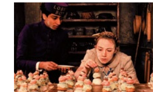
GRAND BUDAPEST HOTEL Director Wes Anderson With Ralph Fiennes, Adrien Brody, Tilda Swinton → 4 Oscars, 1 Berlinale Bear