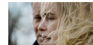
RETURN TO MONTAUK Director Volker Schlöndorff With Stellan Skarsgård, Nina Hoss, Susanne Wolff